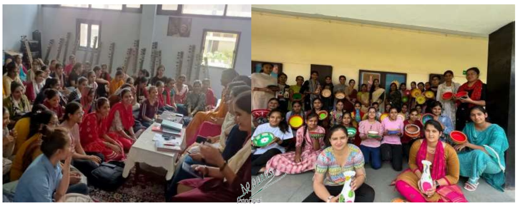
Adarsh Mahila Mahavidyalaya Bhiwani