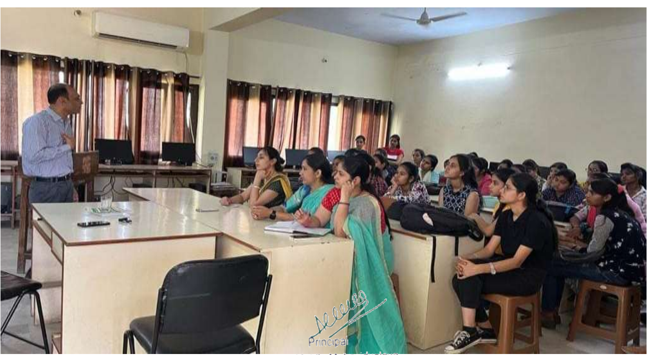
Adarsh Mahila Mahavidyalaya